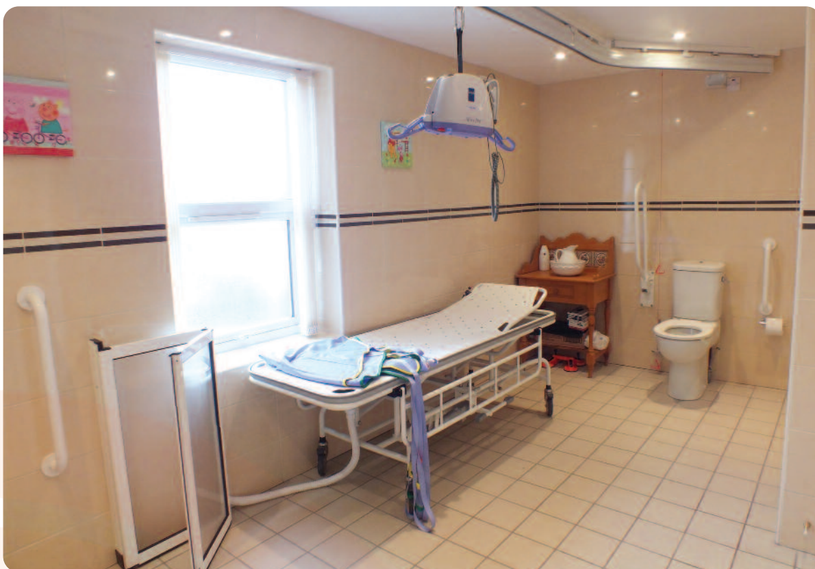
Strangford Bay Lodge provides accessible and welcoming holiday accommodation. The Changing Places toilet is available for public use by request.

Some tourist destinations have spotted the potential and Changing Places have been installed at Divis and Black Mountain, Giants Causeway and Belfast City Airport.