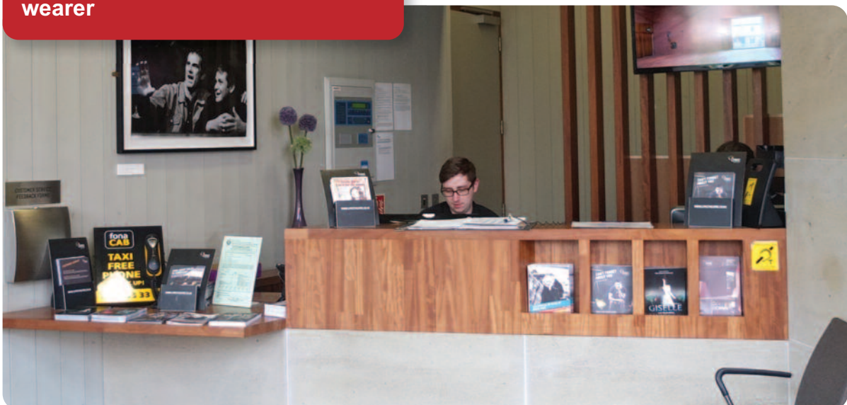
Lyric Theatre’s reception area with lower counter section, available seating and induction loop sign.

Be in the loop: The induction loop sign lets visitors know to switch their hearing aids to the T-setting. One of the Lyric Theatre’s patrons is a hearing aid user, who regularly tests their hearing enhancement equipment.