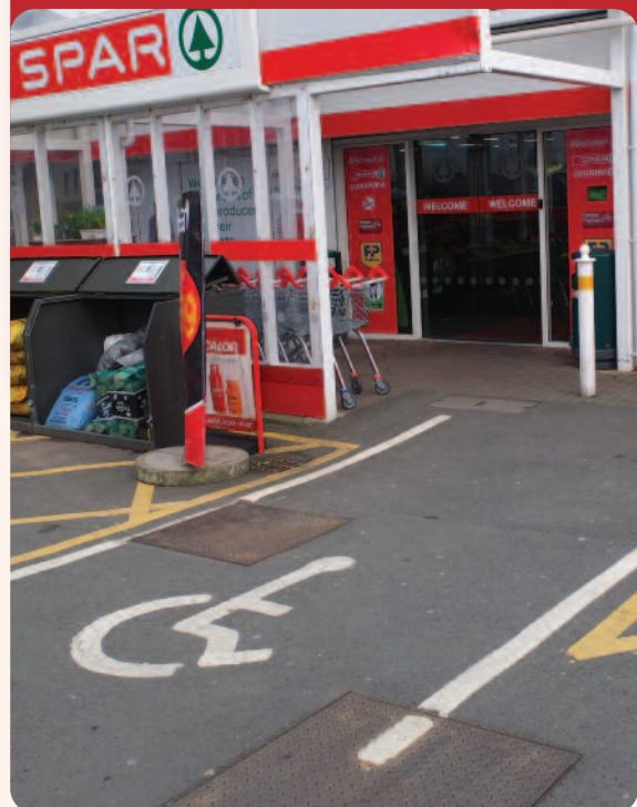
Spar Loughview, Craigavon.

Provide accessible parking close to the entrance, remember to mark hatched safe zones to the side and rear of spaces. Make sure hatches are kept clutter free.