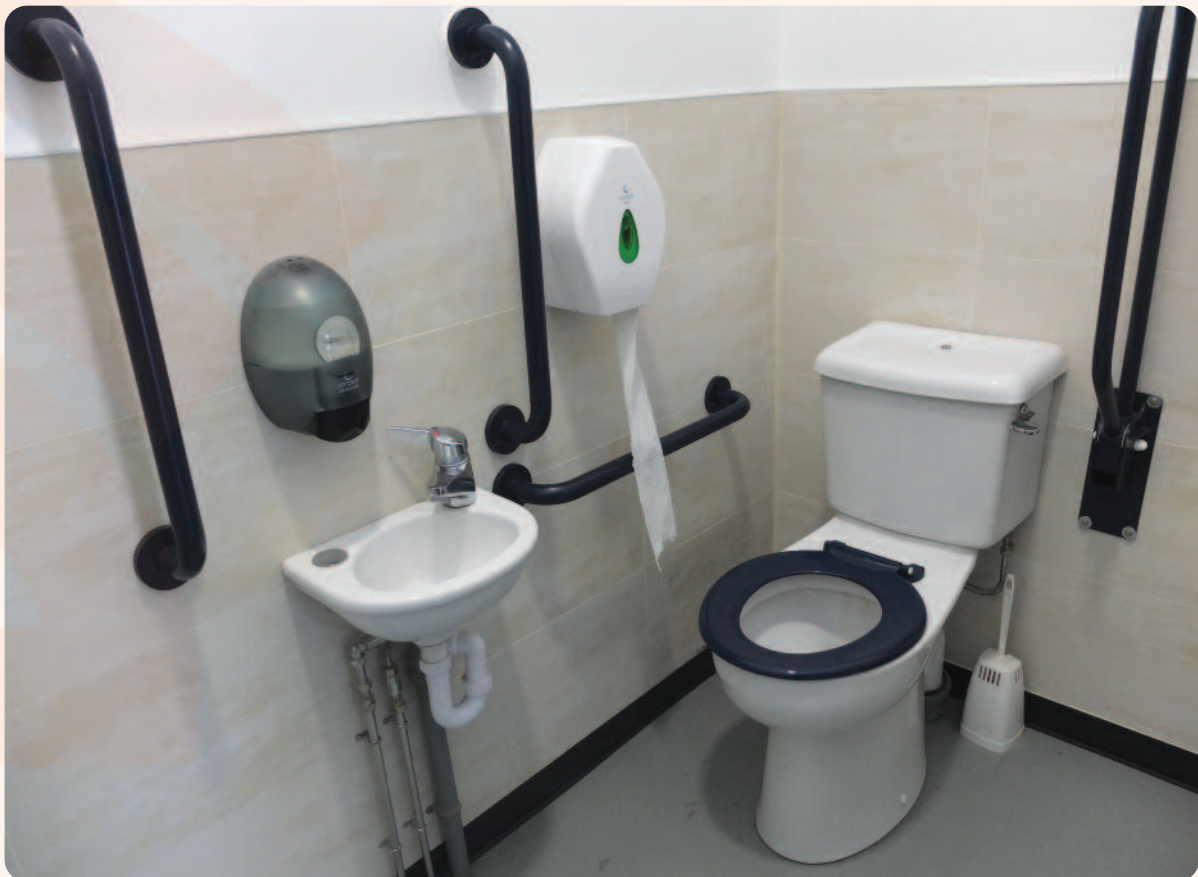
Spar Loughview, Craigavon

Good visual contrast – signs, grabrails, the WC and fittings should contrast against the background, making them easier to identify.